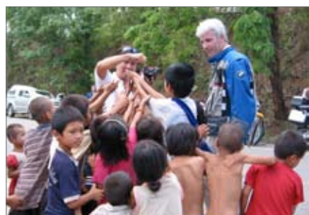
The 'Discovery Moto Tours' team has a nice idea and buys notebooks, coloured crayons and sweets for the little ones. When I open my bag with the 'treasures' hundreds of little dirty hands are stretching out towards me.

So, no excuse! Even though I have never even sat on a bike before, I allow myself to be lulled into the 'Easy Rider Feeling' and book the 'Grand Thai Luxury Tour'. Having been living on the island of Koh Samui for the last 3 years, I had always wanted to travel through my favourite country, quench my thirst for knowledge, and live my personal dream of fulfilment. Apparently Thailand has a reputation for being a biker's paradise. Who knew? Spectacular canyons, countless wild single trails, colourful markets, gigantic temple complexes and nature undiluted. This trip was exactly what I was searching for.