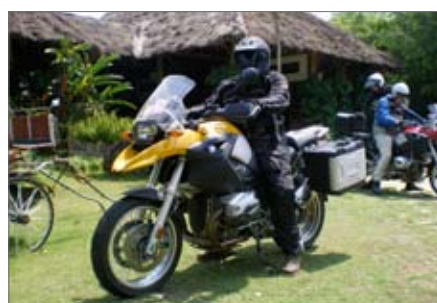
The general rule is never brake hard, always wear the helmet, boots and gloves, and always have a first-aid kit handy. That we will need it a few days later while crossing over to Koh Lanta we do not know at this time. More about this later . . .