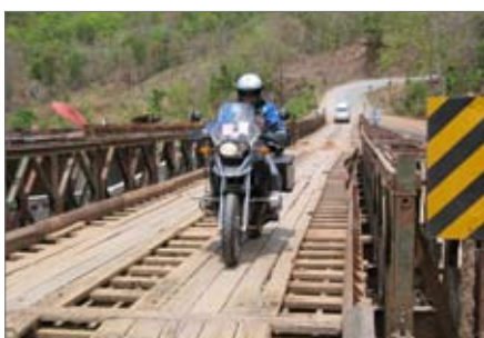
There is a lot of anticipation up in the air between the participants, and also a lot of expectations. After all the 'all-inclusive' package does not come cheap and everybody expects value for their investment. The 'trip of a lifetime' costs about 3.500 B. Pounds.